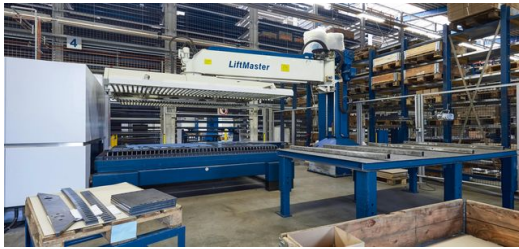
A Stopa storage system takes care of supplying materials while a LiftMaster makes it easier to handle parts.