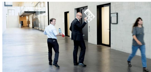
The team of people from the product group, development, purchasing, production, sales, service and project organization departments meets at regular intervals to discuss how development on the TruLaser Center 7030 is progressing.