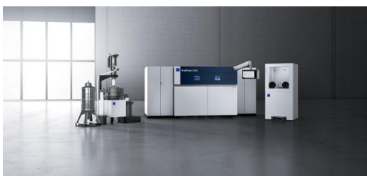
How much automation does 3D printing need? Currently, rather large companies ask for complete automation solutions. Classic job shops prefer to operate the systems alone.