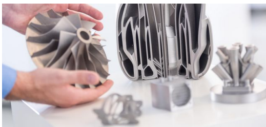
Aerospace, Automotive or Medical: The applications for 3D printing are just as diverse as the technologies and materials. But what are the main trends?

Another aspect of the trend toward multiple elements is the idea of combining 3D printing with other machining methods in a single machine, for example with milling and drilling. Unfortunately, that typically ends up transforming the unquestionable marvels of 3D printing into an annoying drag on the other built-in processes. Right now – and even in the longer term – the difference in processing speeds between 3D printing and traditional methods is simply too great to offer any good reason for combining them in the same machine. That is no longer the case for other additive manufacturing methods, however, such as laser metal deposition.