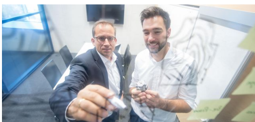
Thinking "in 3D" needs to be learned. Designers have to get away from classical rules like "you can't drill around the corner" and become freer in their minds. New software, which automatically provides design suggestions, supports them in this.