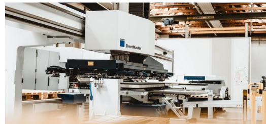
Automation: The SheetMaster supplies the TruPunch 5000 with the required material. This increases efficiency and takes the pressure off employees.