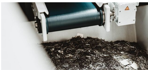
Material-saving: The TruPunch 5000 reduces rejects to a minimum.