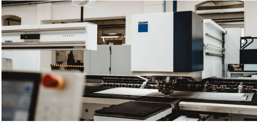
One for all: The TruPunch 5000 not only replaces the historical machine, but also takes over tasks that were previously performed by seven machines.