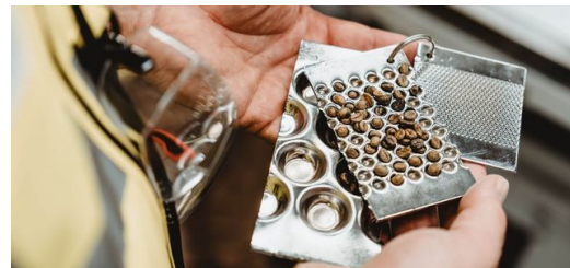
A perfect fit: The dot marking must fit exactly into the depressions in the sheet, the "pockets".