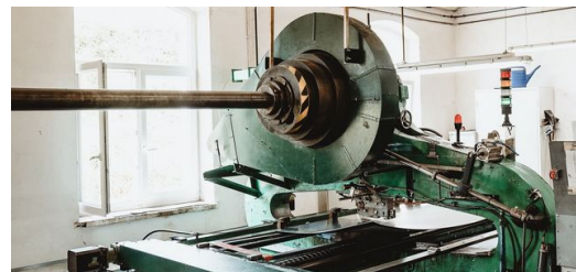
Well-deserved retirement: After 130 years, the old punching machine goes into retirement at the end of the year. The TruPunch 5000 takes over.