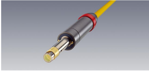
In its own productions of laser light cables TRUMPF welds protective caps using femtosecond lasers. The process is ready for industrial use.