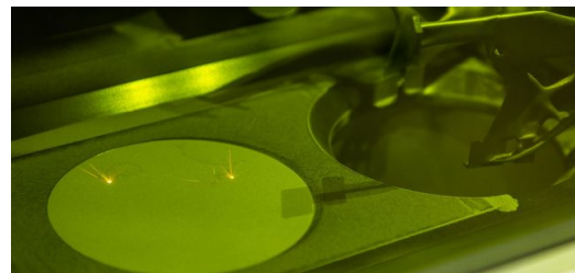
The pulsed laser in TRUMPF's TruPrint 1000 is an excellent choice for creating high-quality surfaces. Its multi-laser capabilities enable highly productive manufacturing processes.