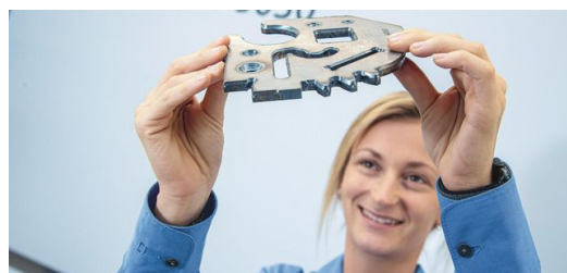
No need to grind parts after welding: EdgeLine Bevel gives parts a smooth, even surface by creating flush seams by avoiding protruding welds.