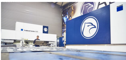
<p>Most up-to-date technologies: Worker with the TruBend Center 5030</p>