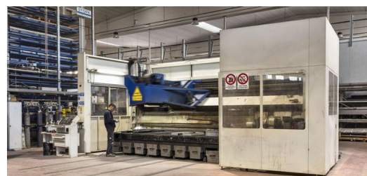
Multi-talented: ELFIM does not just use the Laser cell 1005 to weld and cut 2D and 3D components. The system is also suitable for laser metal deposition.