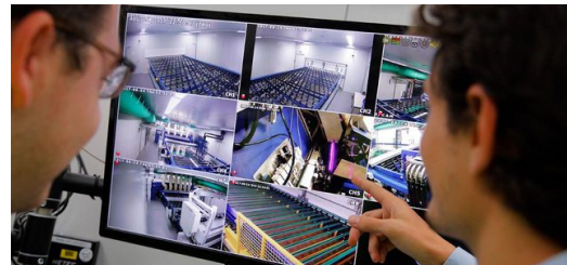
Heating the glass coating very briefly to a high temperature is an essential part of the hardening process. The glass experts at Saint-Gobain spent five years working on their rapid thermal processing method.