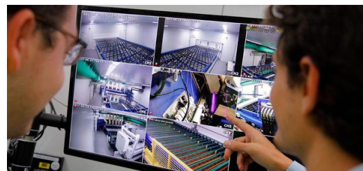
Heating the glass coating very briefly to a high temperature is an essential part of the hardening process. The glass experts at Saint-Gobain spent five years working on their rapid thermal processing method.