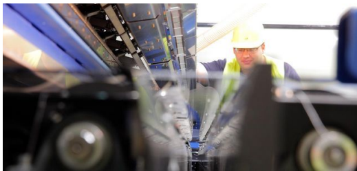
Strahlfallen befinden sich oberhalb und unterhalb der Laserlinie.

“Besides the pure development work, it was challenging to install and ramp up the new machine without affecting production, where some glasses are coated using laser hardening and others are not,” Canova recalls. But their efforts and the five years in total, during which more than ten specialists from the glass manufacturer’s various development departments were involved in the project, have paid off. At the Glasstech 2016 trade fair in Dusseldorf, Saint-Gobain introduced SGG ECLAZ: a new generation of thermally insulating glass for double and triple glazing, which offers not only high light-transmittance values but also 20 percent higher energy efficiency compared to similar glass. A satisfied Lorenzo Canova adds: “Thanks to the new process, we are in a position to create brand-new products.”