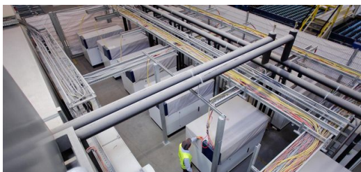
Zwölf Hochleistungslaser erzeugen 144 Kilowatt Leistung.