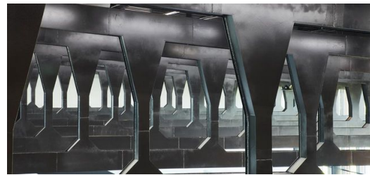
Der Skywalk ist Teil der frei tragenden Deckenstruktur aus Stahl, die von einem TRUMPF Kunden in Atlanta gefertigt wurde.