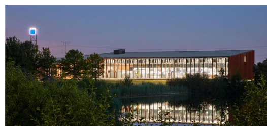
Die Investitionssumme für den 5.500 Quadratmeter großen Standort lag bei 13 Millionen Euro. verantwortlich für den Entwurf des Gebäudes zeichneten Barkow Leibinger Architekten aus Berlin.