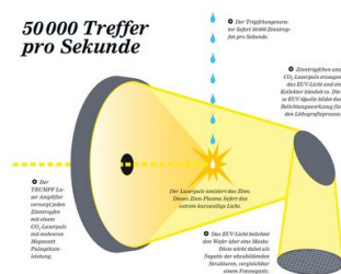
Functional principle of EUV lithography

But it's not all quite so simple. An essential challenge in EUV lithography is to generate light at just this 13.5 nanometer wavelength. The EUV source has to reach several hundred watts of power and make it available for further processing within the optical system. Plasma sources have proven to be the only solution available to date. Plasma is generated either by focusing high-intensity laser radiation or with high energy discharges; tin and xenon are suitable for use as the input materials. Laserproduced plasma (LLP) has established a lead here. The idea behind this process sounds quite simple at first. A generator shoots tin droplets with 50-kiloherz into a vacuum chamber while a laser pulse impacts those droplets as they speed by. The laser thus strikes 50,000 tin droplets per second. The tin atoms are ionized and a high-intensity plasma is created. A collector, using a multi-reflection configuration, catches the EUV light emitted by the plasma, focuses it, and ultimately transfers it to the lithography system to expose the substrate.