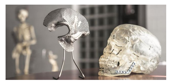
What the eye can't see: the surfaces 3D printing can produce are the key to promoting a connection between the bone and the implant.