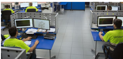
From prototypes to series parts: comprehensive advice is included in the service Lasercor offers. (Pototo Diez)