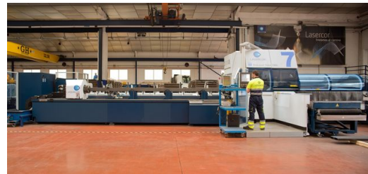
In addition to 2D laser cutting, bending and engraving services Lasercor is specialised in laser tube cutting. The company processes a range of materials, including structural and stainless steel, aluminum, brass and copper. (Pototo Diez)