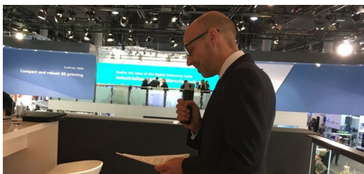
Peter Leibinger, TRUMPF CTO, explains the corporate strategy in the area of additive manufacturing in a press conference at the trade fair.

Add to this the high degree of automation of the system: It starts the production process at the touch of a button, all components calibrate independently - this reduces the effort for the operator and at the same time increases the productivity of the 3D printer. If all process parameters are set optimally, the TruPrint 5000 - compared to 3D printers with one laser - only needs one third of the exposure time per job. A small downer: The TruPrint 5000 is expected to be launched at the end of 2018.