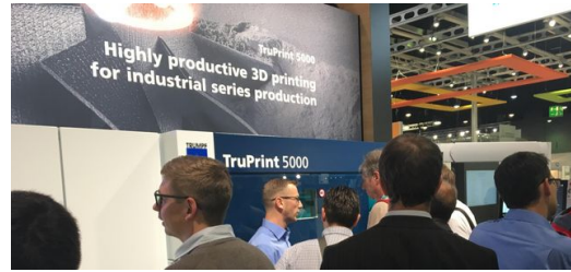
A highlight of the trade fair is the TruPrint 5000 - the interest of the visitors is great.