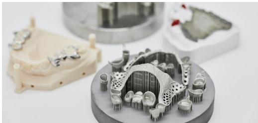
<p>Dentures from the TruPrint 1000 3D printer from TRUMPF.</p>

For example, instead of relying on impression trays, CADSPED offers its clients the use of so-called intra-oral dental scanners. These are manual scanners equipped with sensor systems, which dentists can use to digitally map the patient's mouth in 3D. This data can then be processed further directly, negating the need for a plaster cast. As a result, the whole process is faster, more affordable, and more precise.