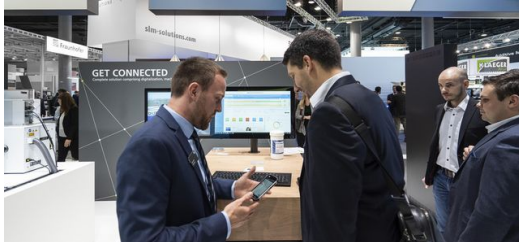
All 3D printers at the exhibition stand were connected to a digital MES

learn how much it will cost to produce the component and how long delivery will take. On top of that, the manufacturer can access the printers and the pending jobs' process data from anywhere in real time.