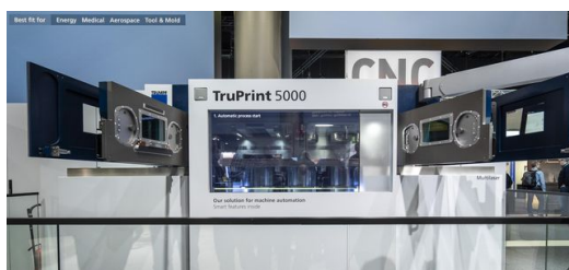
The TruPrint 5000 featuring auto-start