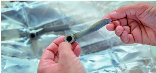
All one piece: Redesigned by Bionic Production, this nozzle offers gentle curves straight from the 3D printer.

virtually every single one of our customers.” The new nozzle is efficient in many different respects. The flow of coolant has been optimized, reducing pressure losses by up to 20 percent. That means you need a lower pressure - and less energy - to achieve the specified coolant exit velocity. The curved channels and optimized jet trajectory take the lubricoolant to the precise place it is needed, delivering no more and no less than is required to carry out the process in an optimum manner without causing thermal damage to the part. This reliable and automated solution for delivering lubricoolant eliminates factors that may have previously caused hold-ups in the manufacturing process.