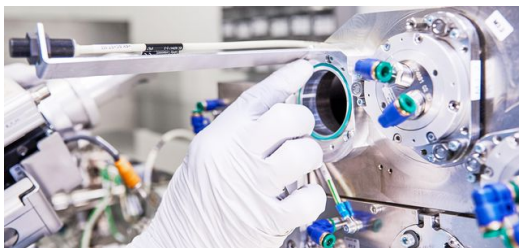
A mechatronics engineer installs a mirror mounting.

One of the biggest challenges of EUV lithography is how to generate light with the extremely short wavelength of 13.5 nanometers. To do this, the EUV light source has to deliver an output of a few hundred watts. That may not sound like much, but it turns out that EUV is an extremely difficult form of light to produce. The challenges involved can be hard to fathom, but one striking fact is that generating EUV light without a laser would require particle accelerators the size of soccer pitches! Which brings us back to the laser; the idea behind the laserbased fabrication process can be expressed fairly simply. Basically, a tin generator fires 50,000 droplets of tin a second (!) through a vacuum chamber and a laser pulse strikes the droplets as they shoot past. This is a kind of high-tech version of clay target shooting – and it generates a plasma in the vacuum that emits EUV light at the desired wavelength of 13.5 nanometers. A collector gathers up the EUV light and delivers it to the lithography system to expose the wafer. To produce the laser pulses, TRUMPF developed a one-of-a-kind beam source based on its CO 2 laser technology – the TRUMPF laser amplifier. In five amplifier stages, this device boosts a weak laser pulse more than 10,000 times, outputting more than 30 kilowatts of mean pulse power. Pulse peak power can be as high as several megawatts.