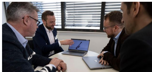
The MultiFocus optics developed by TRUMPF especially for BENTELER produce outstanding results in the pore-free, gas-tight welding of aluminum in combination with BrightLine Weld.