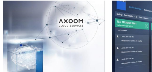
Some of the data is uploaded to the AXOOM Cloud via the Internet.