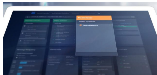
All data forwarded from the laser systems is reported to Daimler using encrypted data connections.