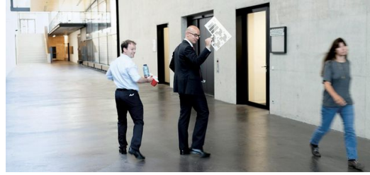
The team of people from the product group, development, purchasing, production, sales, service and project organization departments meets at regular intervals to discuss how development on the TruLaser Center 7030 is progressing.