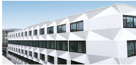
As painted: The facade of the University of Lucerne comes from BIGSTEEL.