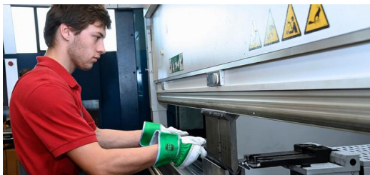
<p><span lang="EN-US">Assistance systems and software help with the work: The TruBend 5230 in use at the Fischer company.</span></p>