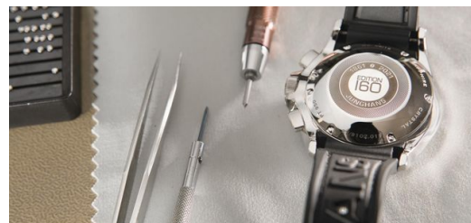
<p><span lang="EN-US">"A watch is simply not finished without the engraving," explains Matthias Stotz. The anniversary engraving is unmistakable with its fine structures, clean lettering and individual limitation number.</span></p>