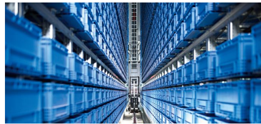
The automated small parts store (AKL) keeps products in 23,000 shelf spots.