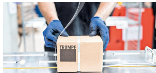
Order Picking.