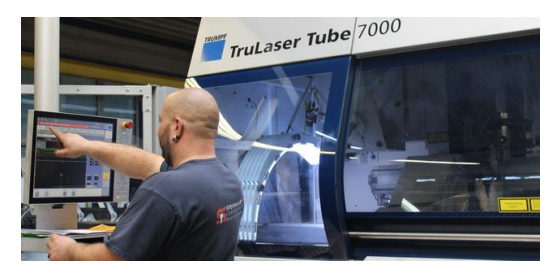
The finished program appears on the machine operator's terminal.