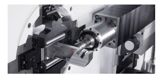
The latest version of the TruLaser Tube 7000 comes with an thread tapping system. The built-in package caters to both standard thread tapping and flow tapping.