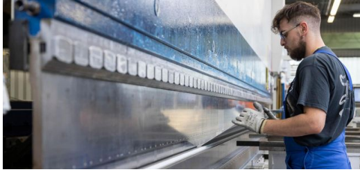
Automation reaches its limits in the production of special profiles. At SCHRAG, they will continue to be processed by bending professionals on bending presses. At SCHRAG's Hamburg Seevetal location, a 12.5-meter press from TRUMPF completes the existing press line.

consultants, underpinned by profitability calculations and the jointly developed fact base, convinced us all. "