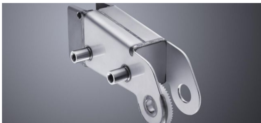
<p> TRUMPF Medizin Systeme setzt in der OP-Tisch-Fertigung auf die Pluspunkte vom Laserschweißen.</p>

This article was first published in May 2014.