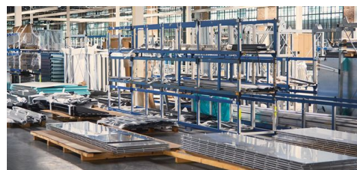
A one-stop service provider: KFK set up its own glass production facility measuring approximately 360 meters long in 2017.