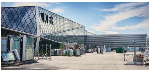
The KFK building in Croatia.