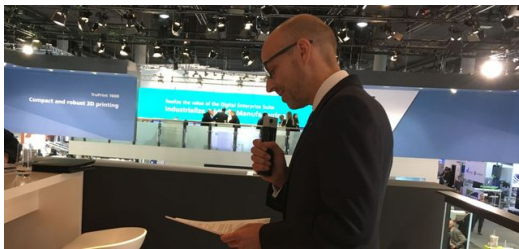
Peter Leibinger, TRUMPF CTO, explains the corporate strategy in the area of additive manufacturing in a press conference at the trade fair.

Add to this the high degree of automation of the system: It starts the production process at the touch of a button, all components calibrate independently - this reduces the effort for the operator and at the same time increases the productivity of the 3D printer.