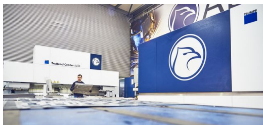
<p>Most up-to-date technologies: Worker with the TruBend Center 5030</p>