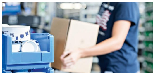
Packing: The person in charge of packaging is notified as soon as an order is complete.