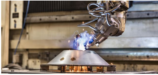
ELFIM uses the Lasercell 1005 for various applications of laser technology such as 2D and 3D cutting or welding and also for laser metal deposition.

perform a 3D scan of an existing replacement part.