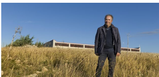
The company ELFIM s.r.l. is situated on a bleak and desolate limestone plateau near Gravina in Puglia.