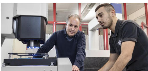
Replacement parts for classic cars are rare. Using the LMD process, they can be reconstructed in a cost-effective way. In such cases experts at ELFIM