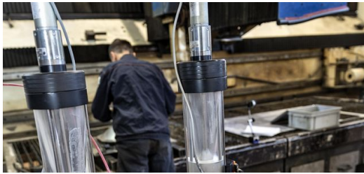
In combination with a powder feeder, the Lasercell 1005 from TRUMPF is also highly suitable for laser metal deposition.

“Strictly speaking, LMD is actually nothing new. It’s a process that has been used for many years now for repairs and coatings. However, we decided to use the process for manufacturing complete components – as is the case with this impeller here.”