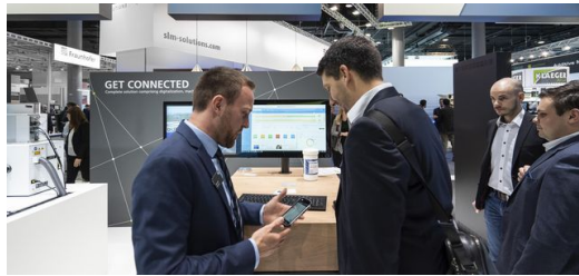
All 3D printers at the exhibition stand were connected to a digital MES

learn how much it will cost to produce the component and how long delivery will take. On top of that, the manufacturer can access the printers and the pending jobs' process data from anywhere in real time.