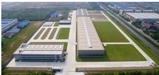
<p>In May 2018, the TRUMPF subsidiary JFY in Yangzhou opened the Group's largest production site worldwide to date. The production area is 19,000 m<sup>2</sup>.</p>