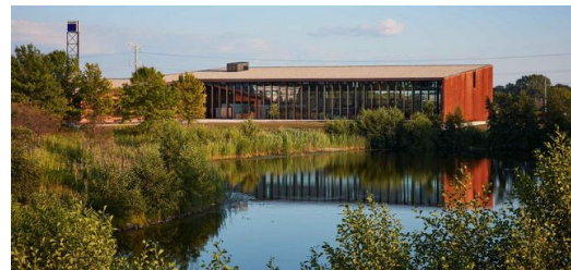
<p>In Chicago, TRUMPF inaugurated a Smart Factory for networked sheet metal processing in 2017.</p>