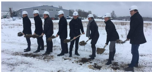
<p>The ground-breaking ceremony for the new production hall at the TRUMPF site in Hettingen in January 2019. 120 employees are to move into the competence center in two years.</p>