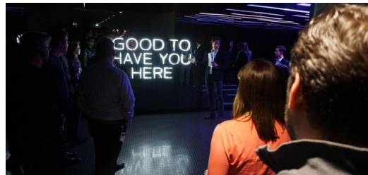
The words in the TRUMPF own tunnel system has been handcrafted exclusively for the company. Electrodes excite the gas in the tubes that form the words, making it light up.