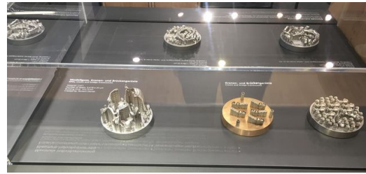
Substrate plates with 3D-printed dental prosthesis.