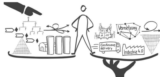
For a flexible organization, you need both stability and agility.