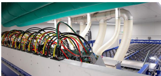
Laserlichtleitungen verbinden die Optiken mit den Lasern.