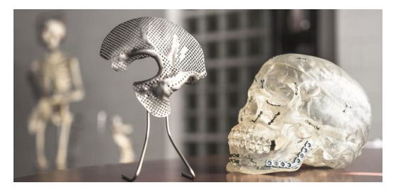
>What the eye can't see: the surfaces 3D printing can produce are the key to promoting a connection between the bone and the implant.