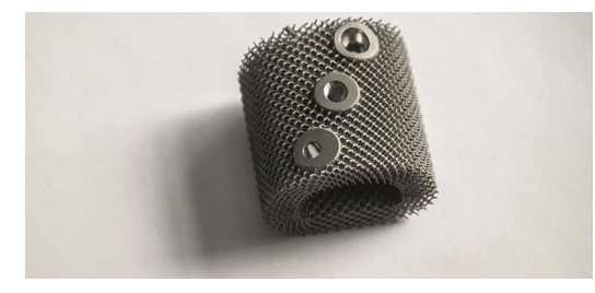
<span lang="EN-US">Prototype for 3D printed cages: for a long time, spinal fusion was the option of last resort for a herniated disc, but now 3D printed cages can restore vertebral segments to their natural height, allowing patients to return to pain-free mobility.

CONMET uses a Tru Print 1000 from TRUMPF to develop parameters and test different geometries and materials. "Our aim is to better understand all the processes involved," says Morozova. "That will enable us to produce custom-made, patient-specific implants and give us the groundwork we need to embark on full-scale production at the earliest possible stage." This is the second 3D printer from TRUMPF to be commissioned at CONMET. In early 2018, the company began using a TruPrint 1000 to make dental and craniomaxillofacial implants for cancer and traumatology patients. As well as the machine itself, TRUMPF also supplied the appropriate titanium powder, substrate plate, recoater tool and software. TRUMPF's high level of expertise and the overall success of the collaborative process were the deciding factors behind Dmitry Tetyukhin's decision to acquire the second printer. Morozova explains: "The TRUMPF experts in Ditzingen and their colleagues at the Moscow subsidiary offered us extensive support and advice to help us introduce the new technology and proved to be truly reliable partners. Their expertise played an invaluable role in the second project, too – for example when it came to determining the right parameters." CONMET plans to purchase a TruPrint 3000 to kick off full-scale production of its spinal implants.