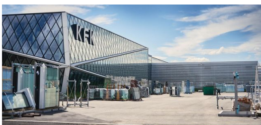
The KFK building in Croatia.