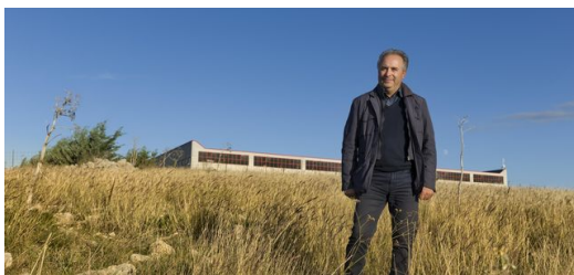
The company ELFIM s.r.l. is situated on a bleak and desolate limestone plateau near Gravina in Puglia.