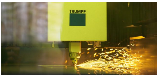
In March, FBT workers started using their new TruLaser 3030 to cut thin sheets and blanks to size.