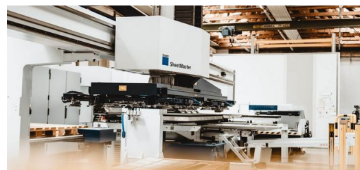
Automation: The SheetMaster supplies the TruPunch 5000 with the required material. This increases efficiency and takes the pressure off employees.