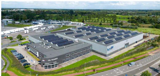
VDL Technics, located in Boxtel, the Netherlands, is a subsidiary of the VDL Group, specializing in the manufacturing and series assembly of complex metal assemblies.