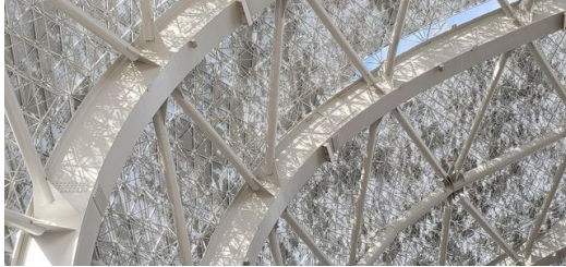
<p>The perforated panels allow light and air to pass through - it was the architects' ambition to build an open arena in which people are nevertheless protected. </p>