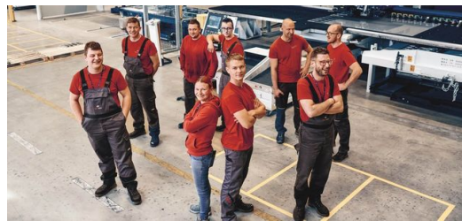
Smart factory: Getting the new machines up and running in Slovenska Bistrica was one thing, but adopting a new shop-floor mindset was quite another! The key was getting everyone to implement the manufacturing philosophy of connected manufacturing in their day-to-day work.