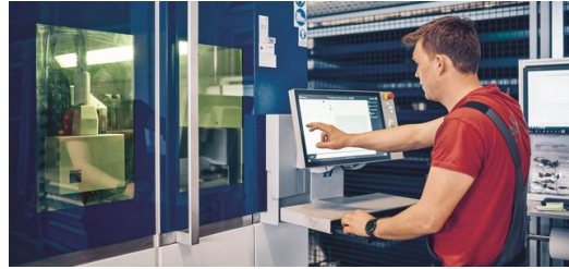
Sought-after partner: Elpro Križnič is a byword for high-quality turnkey solutions in sheet-metal fabrication and in the energy industry.