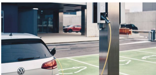
Sustainable development: The charging stations for the company's vehicle fleet are powered by rooftop solar panels.