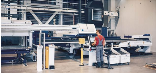
Welding, punching, bending: TRUMPF machines help Elpro achieve top-notch part quality, productivity, and flexibility.