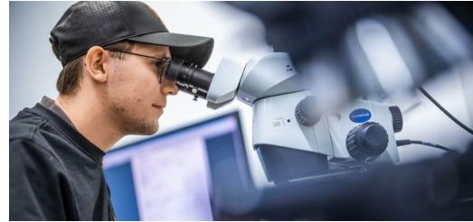
Tireless efforts to enhance and innovate — that keeps customers happy and won the company a "Bavaria Best 50" award in 2023.