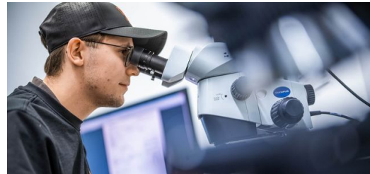
<p>Tireless efforts to enhance and innovate — that keeps customers happy and won the company a "Bavaria Best 50" award in 2023.</p>