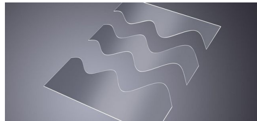
All outlines are possible: no matter whether straight or curved. Inside curves are no problem, either.

It distributes the intensity of the laser light uniformly along the axis of the beam. In this way the focus is stretched in length; the beam spot becomes a focus line. The laser pulses no longer scan the glass level by level, but instead modify – in a single pass – the complete interior separation surface.